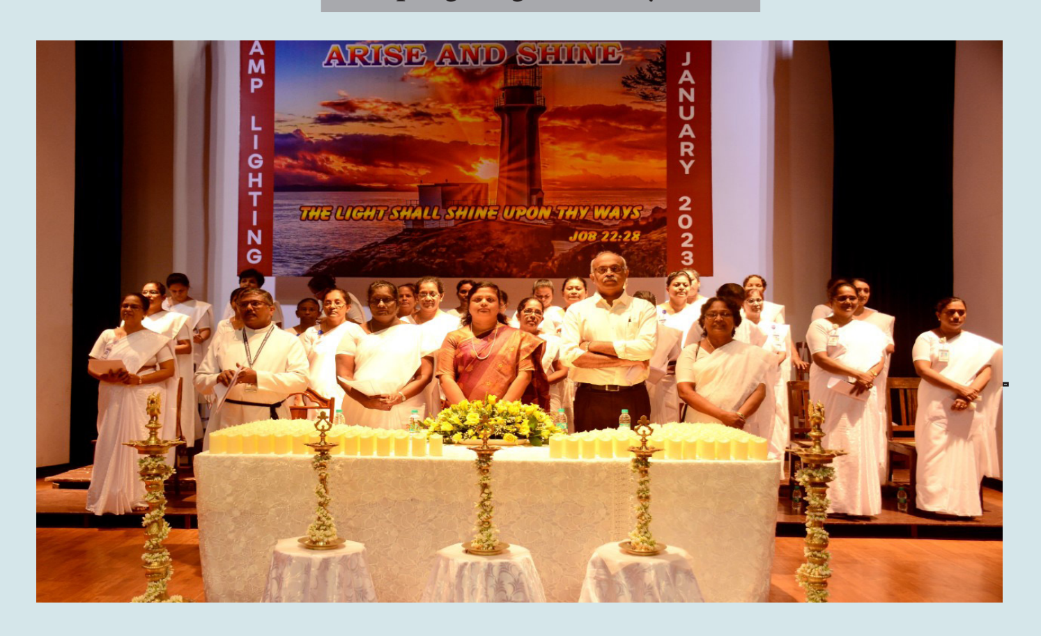
Lamp Lighting Ceremony - 2023