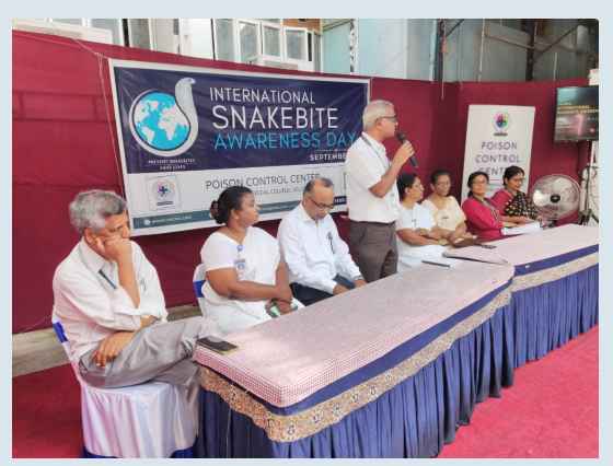
International Snakebite Awareness Day - commemorative programme

The 6<sup>th</sup> International Snakebite Awareness Day was observed by the CMC Poison Control Centre on 19<sup>th</sup> September, 2023. The day marked the culmination of year-long activities that were organised to increase awareness about snakebite prevention and appropriate first aid amongst communities in and around Vellore.