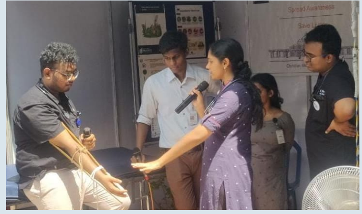
International Snakebite Awareness Day – a stall demonstrating limb immobilization and another with displays of snakebite prevention and first aid.