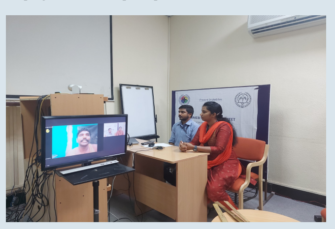
The Annual Snakebite Survivors' Meet