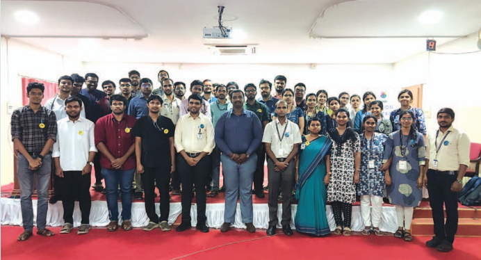
"STING 2023" - the final round of the quiz in progress and all the participants.