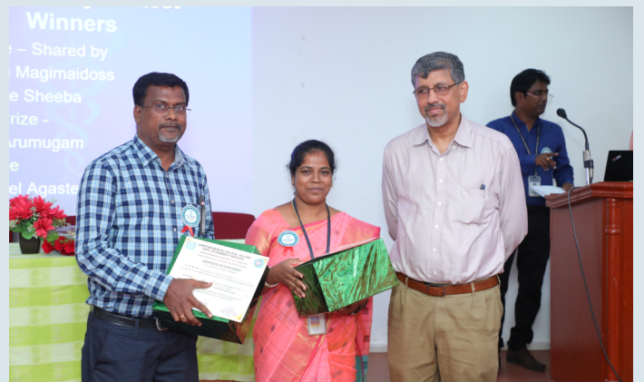
Voice Over PPT - 1 st Prize