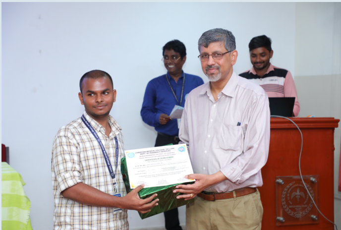
Poster Design - 1 st Prize