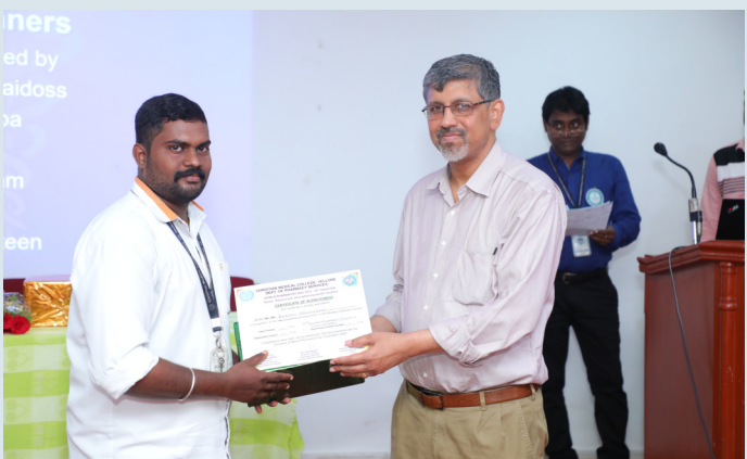
Voice Over PPT - 2 nd Prize