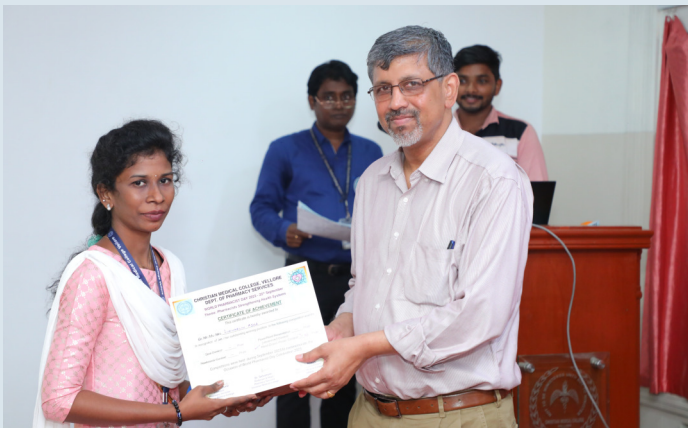
Poster Design - 3 rd Prize