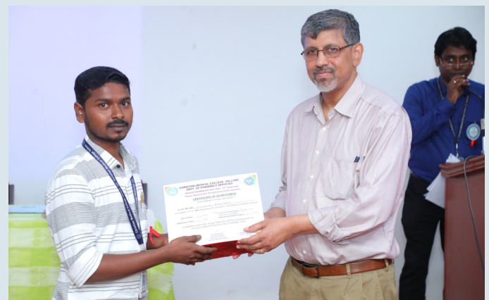
Voice Over PPT - 3 rd Prize