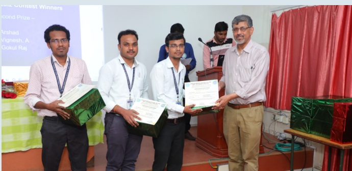
Quiz Programme - 1 st Prize