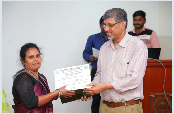
Poster Design - 2 nd Prize