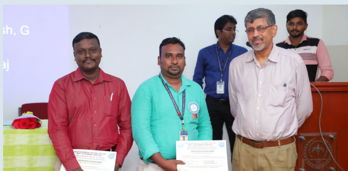
Quiz Programme - 3 rd Prize