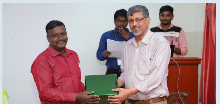
Flash Card - 1 st Prize