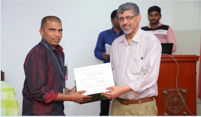
Flash Card - 2 nd Prize