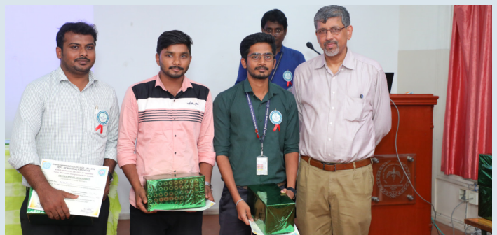
Quiz Programme - 2 nd Prize