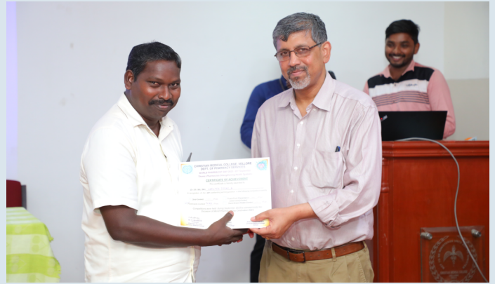
Flash Card - 3 rd Prize