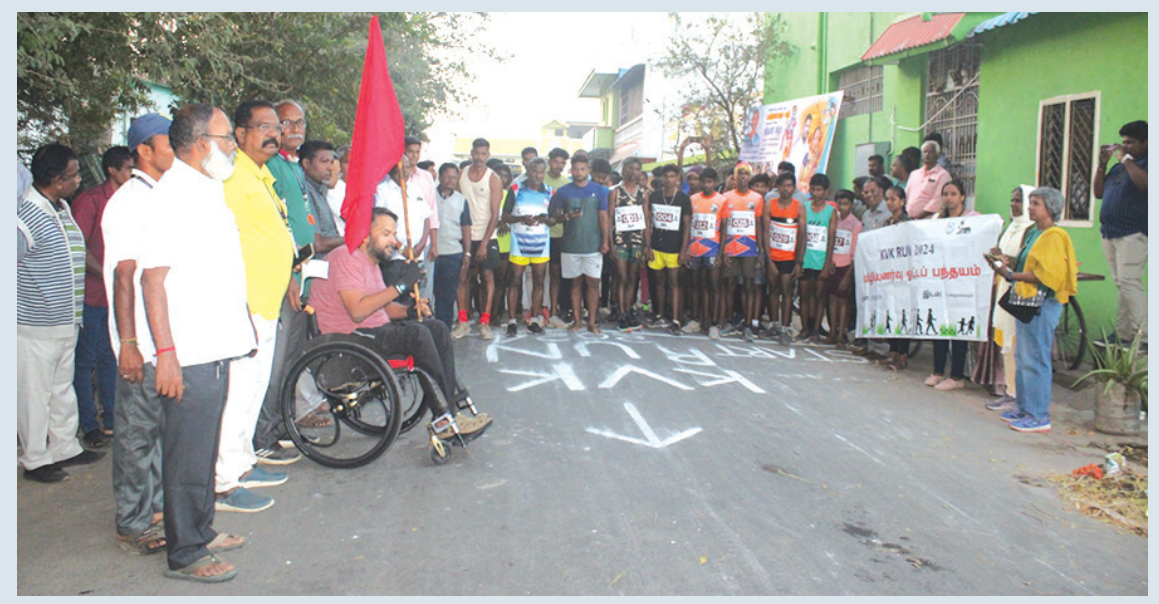
KVK Run 2024

You will keep in perfect peace those whose minds are steadfast, because they trust in you. Isaiah 26:3