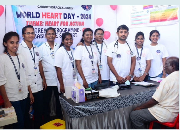
The CMC's Cardiology and Cardiothoracic Surgery departments jointly celebrated World Heart Day on September 27, 2024, with various events to raise awareness about heart health.