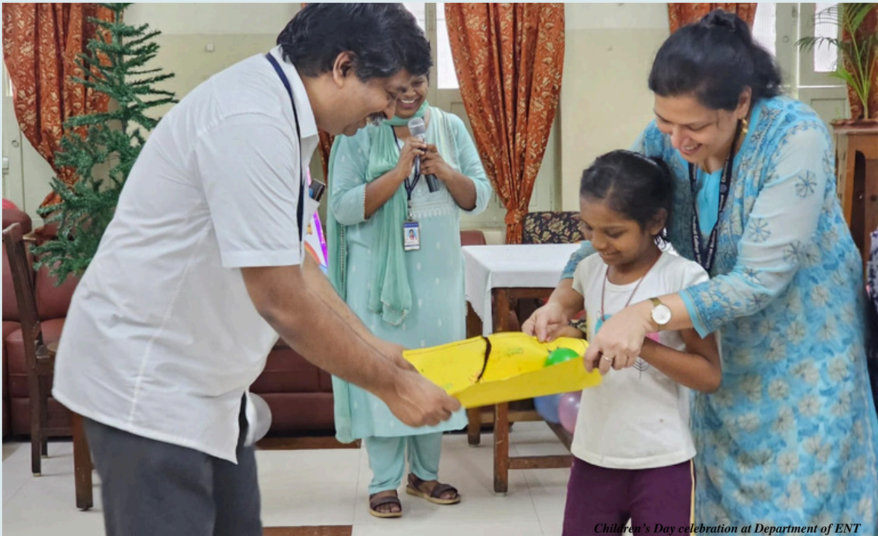
Children's Day celebration at Department of ENT